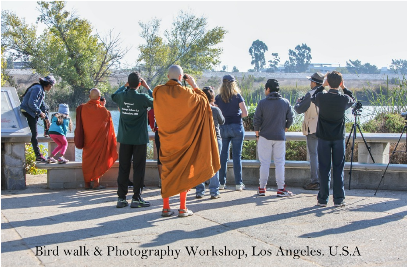
Bird walk & Photography Workshop, Los Angeles. U.S.A