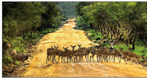
One of the many photographs of wildlife in Sri Lanka. This one of a herd of spotted deer was taken at the Yala National Park.